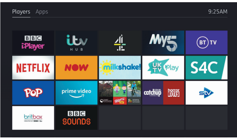
*Britbox Player coming soon

With on-demand services you can watch what you like, whenever you like.