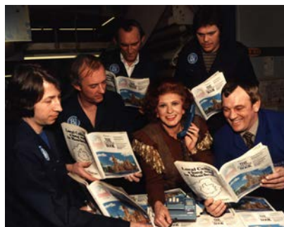
Actress Pat Phoenix promoting the launch of the new style phone book, 1984 (TCC 474/HF 33-U)

In 1984 a new style Phone Book was launched with improved supplementary information and an easier to read format. This was initially introduced in Manchester and subsequently used nationwide.