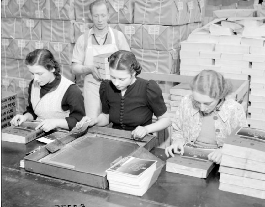
Gumming on front cover advertisements, 1938 (TCB 473/P 8329)