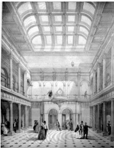
Electric Telegraph Company, main hall, c1848 (TCE 361/ARC 76)

The development of the telegraph system in the United Kingdom closely followed the growth of the railways with telegraph offices often being located at stations. A close relationship also existed between the two sets of companies with a great deal of crossover of names in the lists of shareholders and directors. The Government allowed the network to develop under private ownership and did not intervene significantly in its running. This was in sharp contrast to the telegraph system on the Continent which had been under state ownership since its inception.