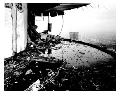
Bomb damage, 1971 (TCB 346/T 833)

At 4:30am on 31 October 1971, a bomb exploded in the male toilets on the 31st floor (no-one ever claimed responsibility for hiding the device). No-one was injured in the blast but the physical damage took two years to repair. It was decided that public access to all areas was no longer viable and the restaurant closed in 1980 when the contract expired (by this time, more than 4.5 million people had visited the tower).