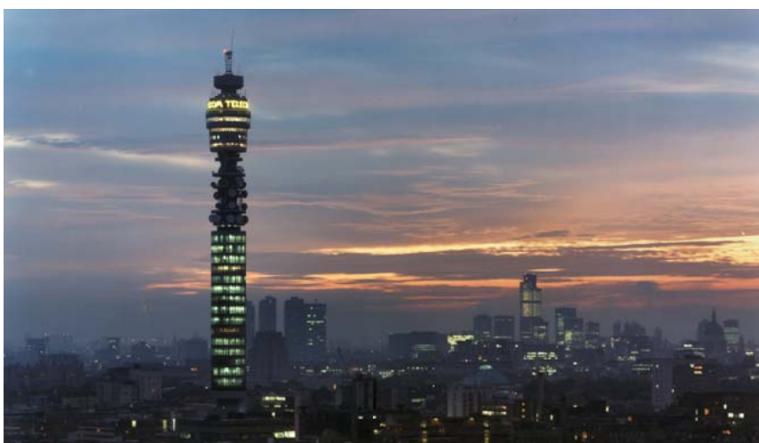
BT Tower at dawn, 1985 (TCB 417/E 80309)

If you have visited or worked at BT Tower please add your story to www.connected-earth.com/memories .