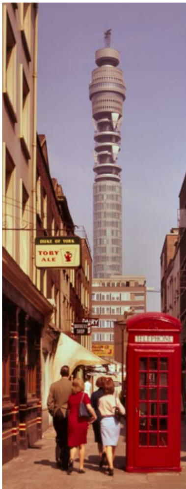
BT Tower in 1966 (TCB 346/T 648)

In 1954 a system of broadband and microwave radio links was proposed to meet the expected growth of the long distance telephone and television networks between London and the provinces. The solution was a striking addition to London's skyline.