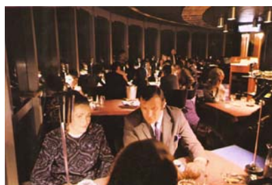
Diners in the tower's restaurant, 1966 (TCB 346/T 849c)

The Top of the Tower restaurant and cocktail bar was managed by Butlins and had a menu boasting "strawberries, whether in season or not".