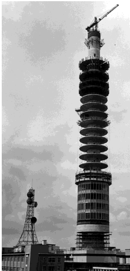
BT Tower under construction, 1964 (TCB 346/T 174)

In line with other tall buildings, the structure expands and contracts with the temperature. The tower can be as much as 23cm shorter in the winter than it is in the summer.