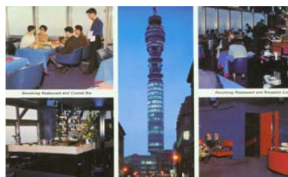
Souvenir postcard (TCG 263/13)

In the shop, tower souvenirs proved incredibly popular with 1,500 plastic tower models sold in just two weeks.