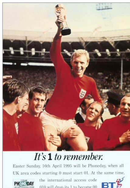
Promotional poster for Phoneday, 16 April 1995 (TCB 325/EHA 5421)

Despite these changes on 22 April 2000, new dialling codes were introduced combined with alterations to existing local numbers for London, Southampton, Portsmouth, Coventry, Cardiff and Northern Ireland.