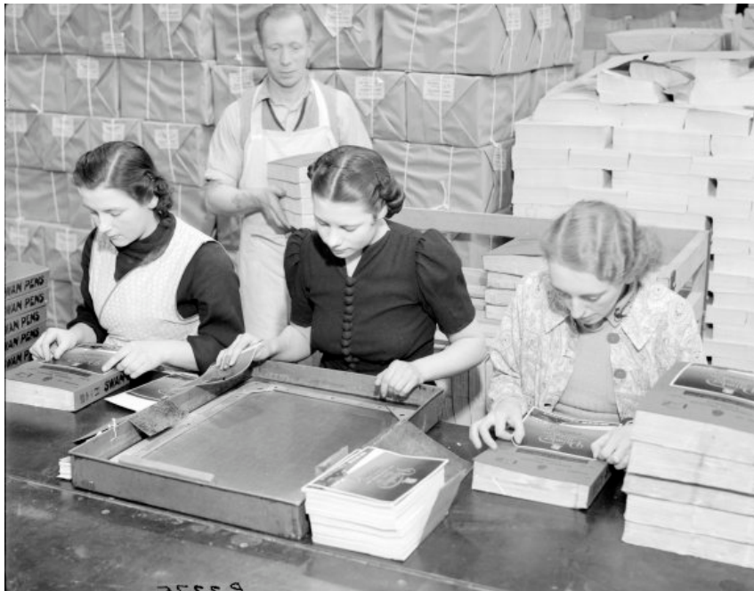
Gumming on front cover advertisements, 1938 (TCB 473/P 8329)