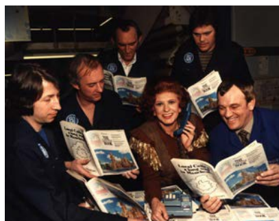
Actress Pat Phoenix promoting the launch of the new style phone book, 1984 (TCC 474/HF 33-U)

In 1984 a new style Phone Book was launched with improved supplementary information and an easier to read format. This was initially introduced in Manchester and subsequently used nationwide.